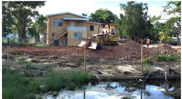
While the clay was being delivered, it was spread through the kind assistance of Cisco Construction Ltd.