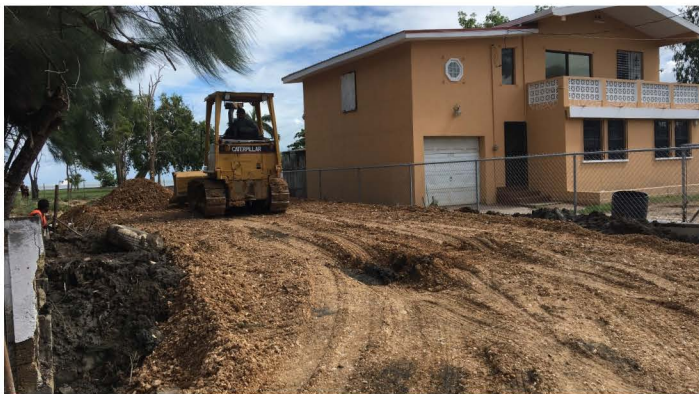
Not only did Cisco Construction Ltd. donate the fill but also the machinery to spread the fill on the lot