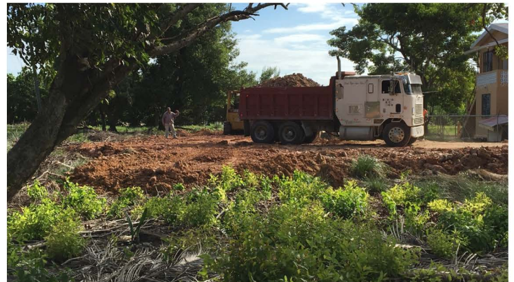
Dump trucks delivering clay fill to the Scout lot