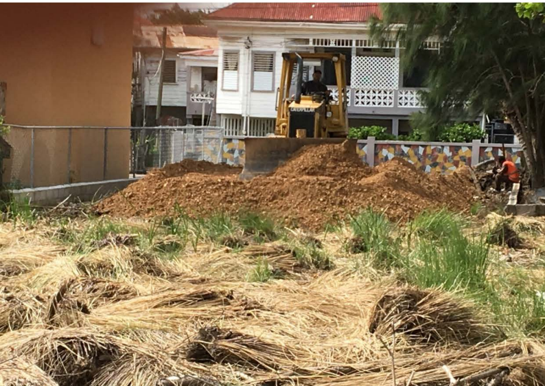
Cisco machinery and personnel spreading first loads of fill on Scout lot

November 16, 2018 will be a landmark date for the construction of the Sir Colville N. Young Building as it was the day that the first load of fill was delivered to the Scout lot. This first phase of the project was aimed at preparing the driveway so that clay fill material could be dropped off at the back of the land to facilitate the spreading of the fill. This was followed by many more loads of fill donated by Cisco Construction Ltd.